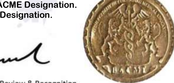
Chair, Committee for Review & Recognition